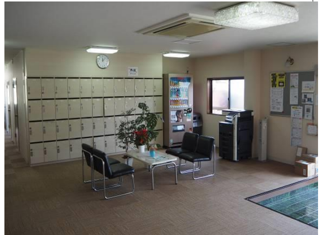
< 玄関 Entrance >