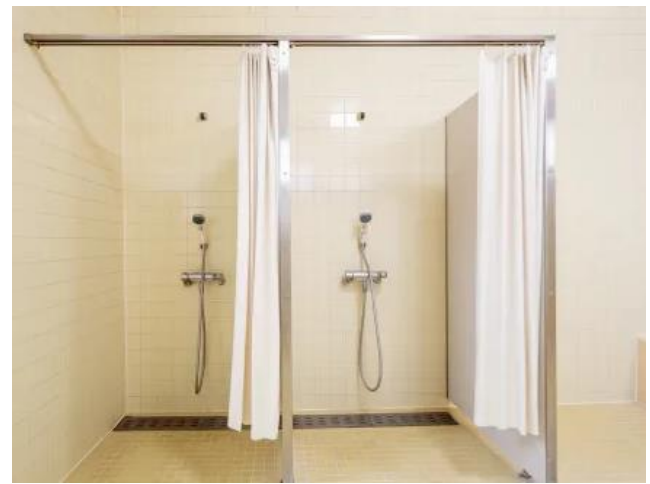
< 浴室内シャワー Shower room in public bath >