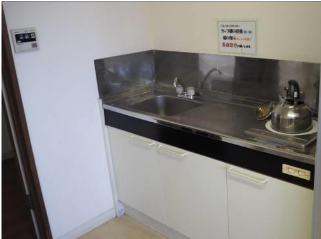
< キッチン Kitchen >