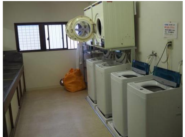
< ランドリー Laundry >