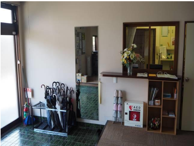
< 管理人室 Dorm manager's office >