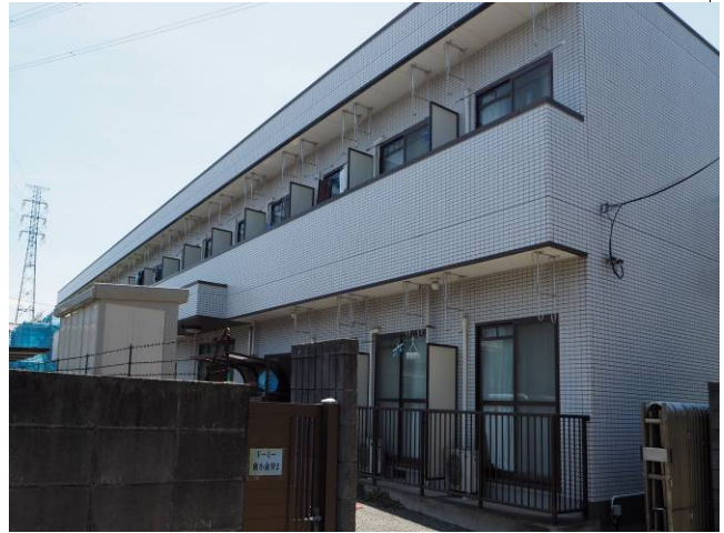
< 外観 External Appearance >