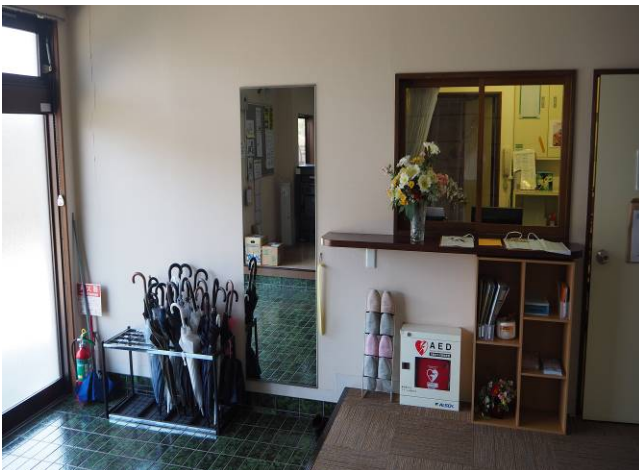
< 管理人室 Dorm manager's office >