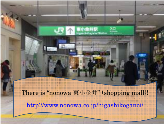
< 東小金井駅 Higashi-koganei station >