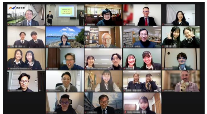
< Participants and Judges >