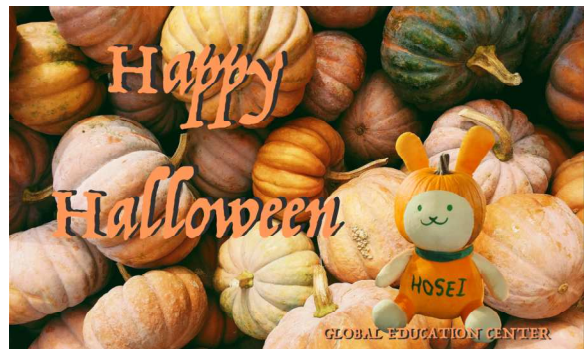
<ECOpyon also welcomes you in Halloween style>

decorations, and the G-lounge English advisors on Tama campus could even be spotted in (a hint of) Halloween costume. The treats for visitors, in addition to GI (Student Coop)'s joining in the action on Tama campus, the visitor number peaked at 127!!