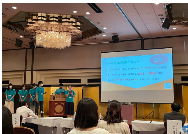
<Presentation in the final>