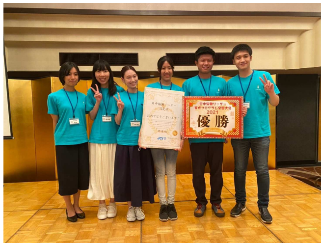
<Yokohama team that won>