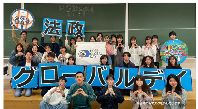
< Student executive committee members >