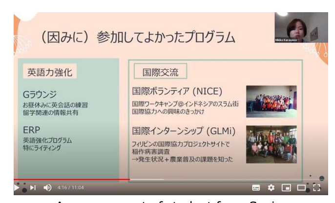
<Announcement of student from Spain >