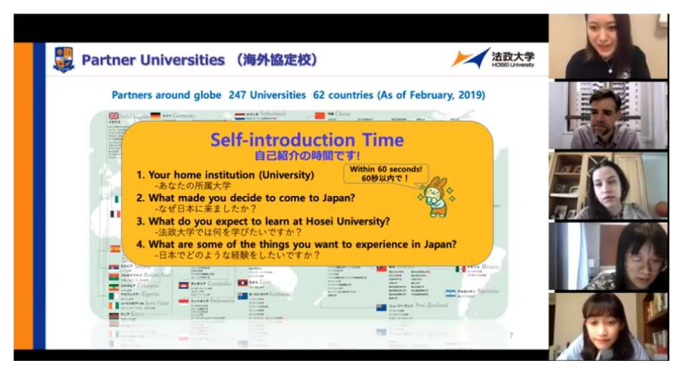
<One frame of the orientation>

Students returned to campus as the new academic year began, after almost a whole year of "online life". The coronavirus pandemic continues to impact study abroad activities, but we seize every opportunity to facilitate international exchange.