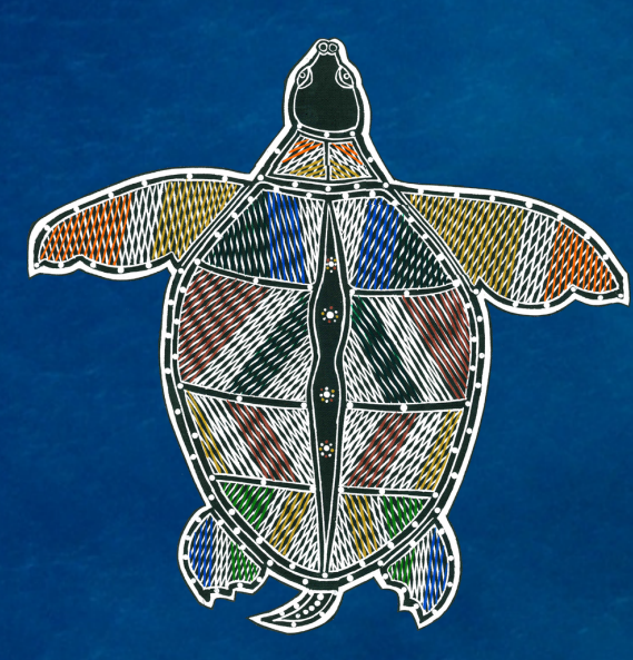
Friday 25 June Australia's First Peoples: An Introduction