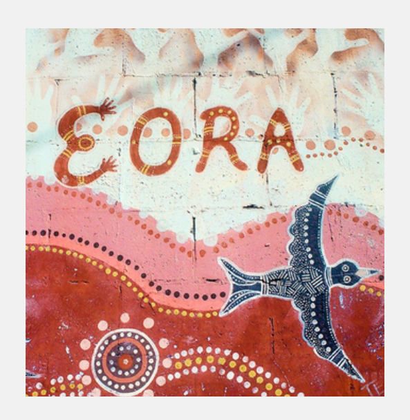
Australia's First Peoples: An Introduction Friday 25 June

Learn about one of the oldest living cultures on the planet and the important place of First Nations peoples in Australian history until today.