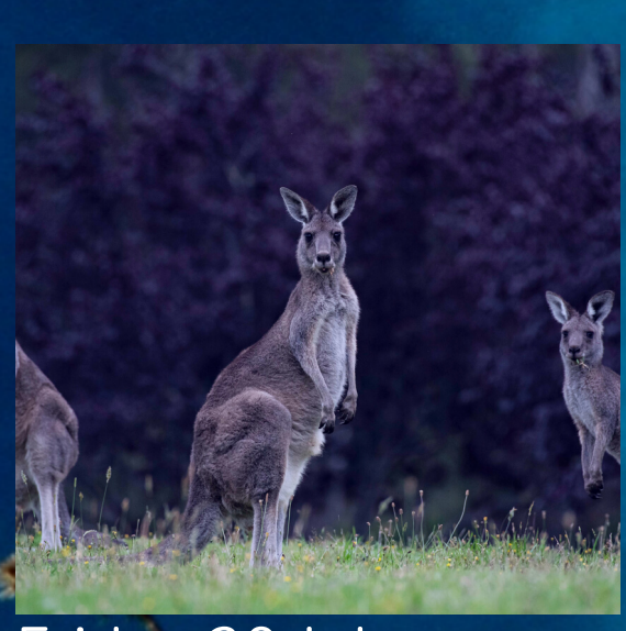
Friday 30 July The Weird, Wacky and Wild-Life of Australia