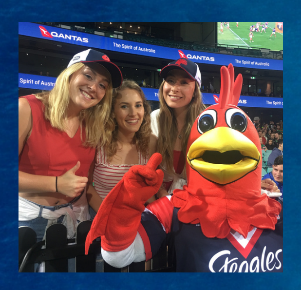
Friday 11 June Howzat! The Aussie relationship to Sport