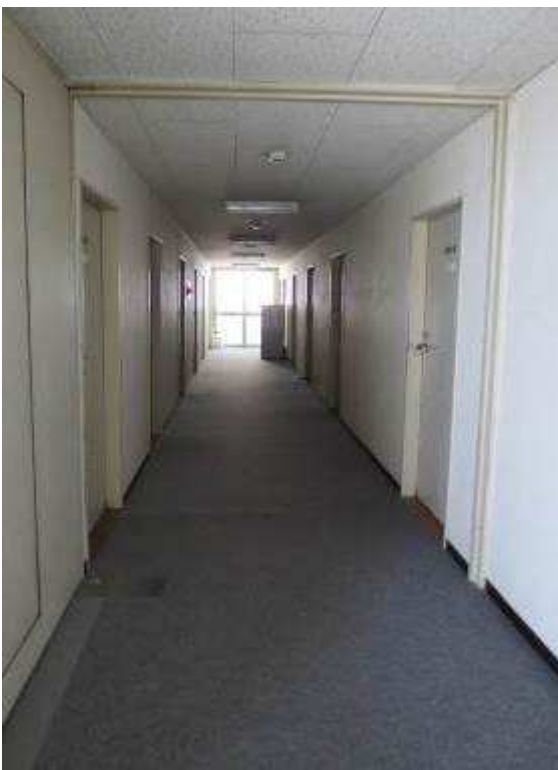
< 廊下 Corridor >