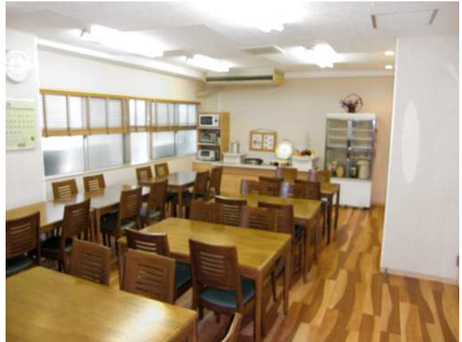
< 食堂 Dining Room >