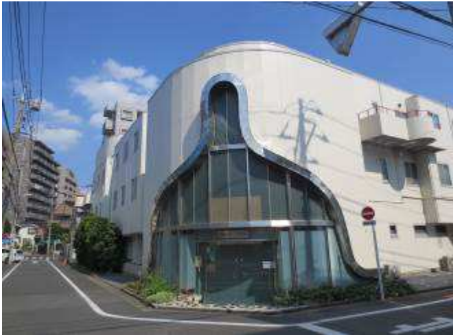
< 外観 External Appearance >