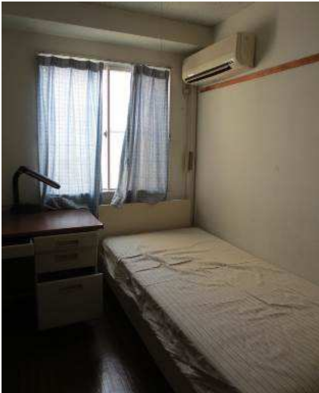
< 部屋 Room >