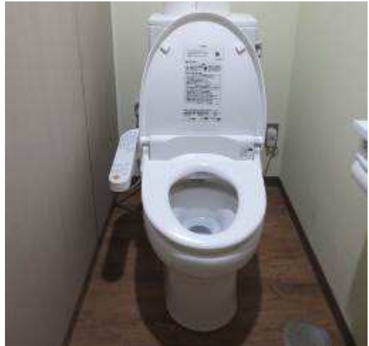
< トイレ Toilet >