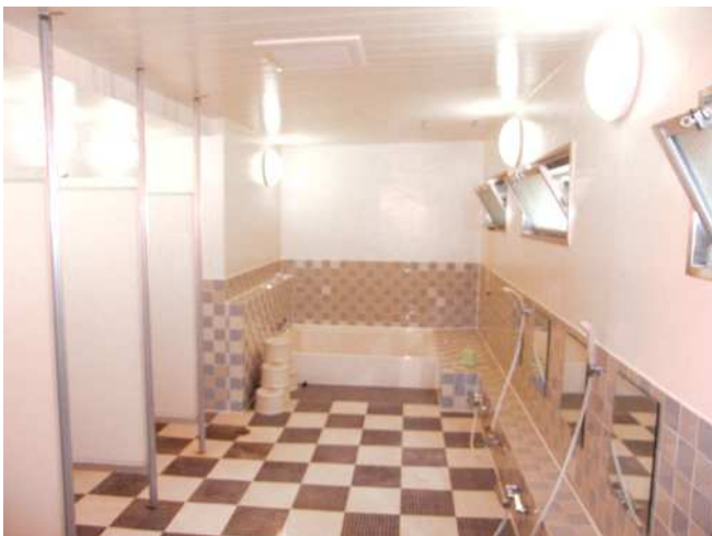
< 浴場 Bathing area >