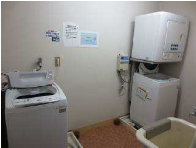
< ランドリー Laundry >