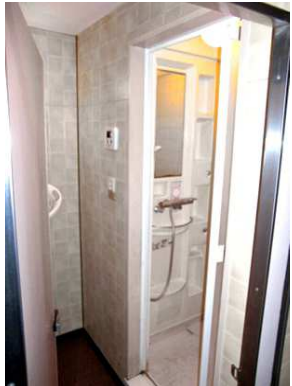
< シャワールーム Shower Room >