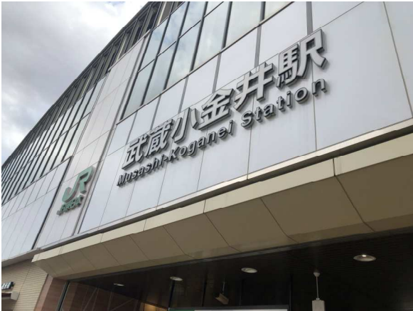
< 武蔵小金井駅 Musashi-koganei station >