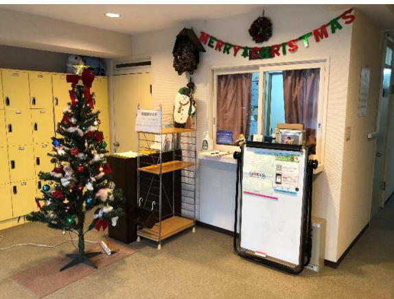
< 管理人室 Dorm manager's office >