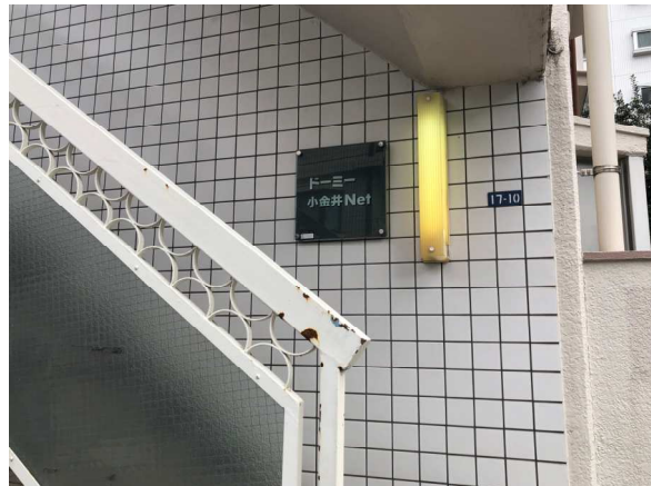
< 外観 External Appearance >