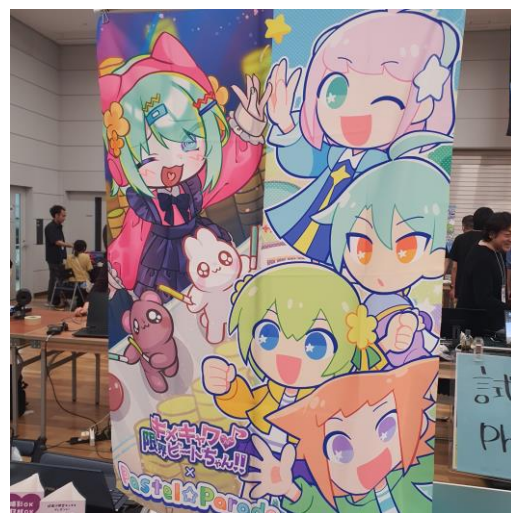
Exhibitions and events that I saw in Japan