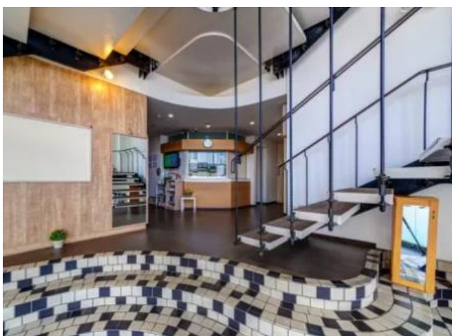
< 玄関 Entrance >