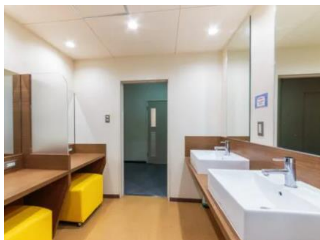
< パウダールーム Powder room >