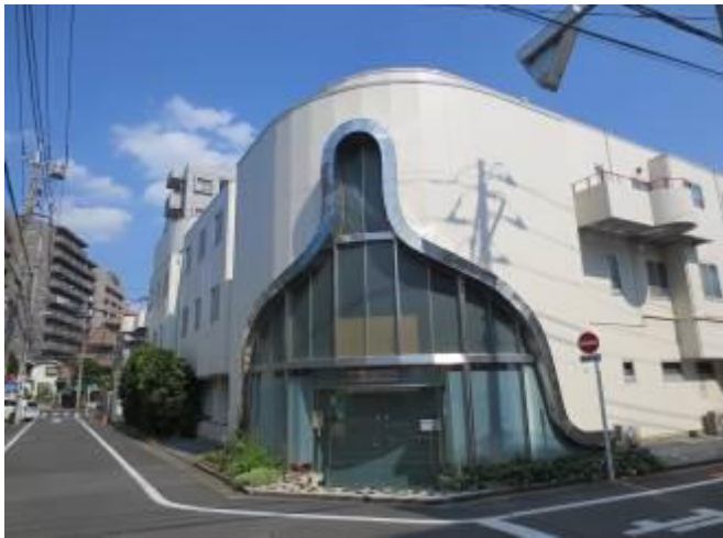
< 外観 External appearance >