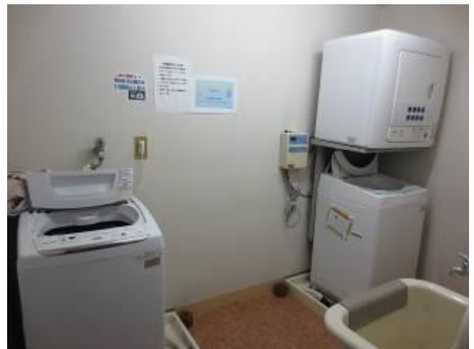
< ランドリー Laundry >