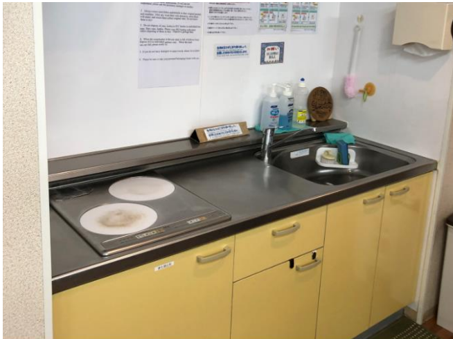
< キッチン Kitchen >