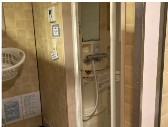
< プライベートシャワー Private shower room >