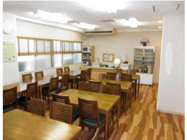
< 食堂 Dining room >