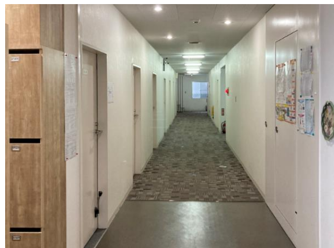
< 廊下 Corridor >