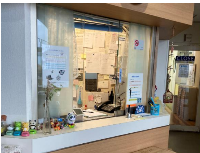
< 管理人室 Dorm manager's office >