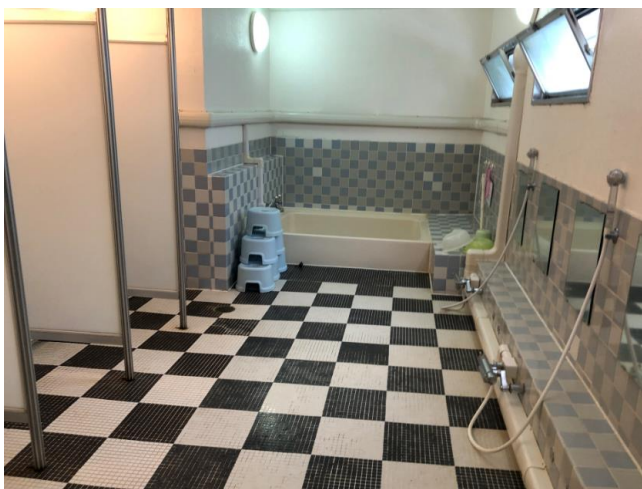
< 浴室 Public bath >