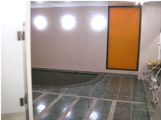
< 浴室 Public bath >