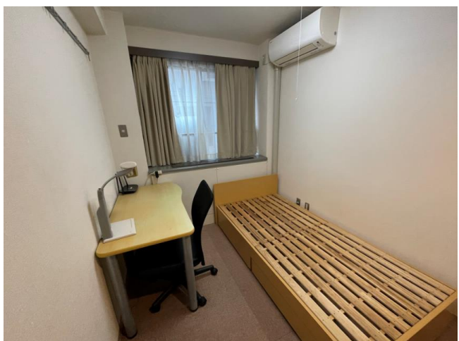
< 部屋 Room >