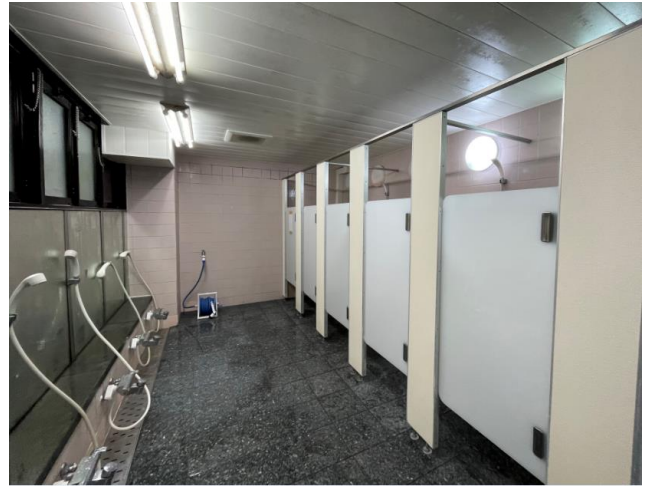
< 浴室内シャワー Shower room in public bath >