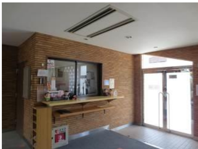
< 管理人室 Dorm manager's office >