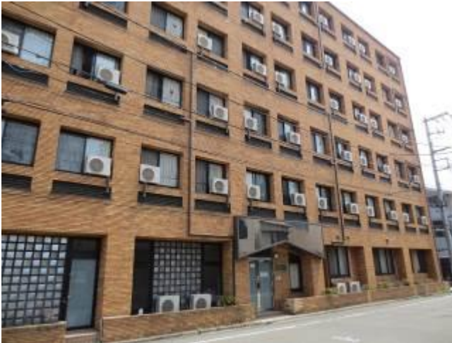
< 外観 External appearance >