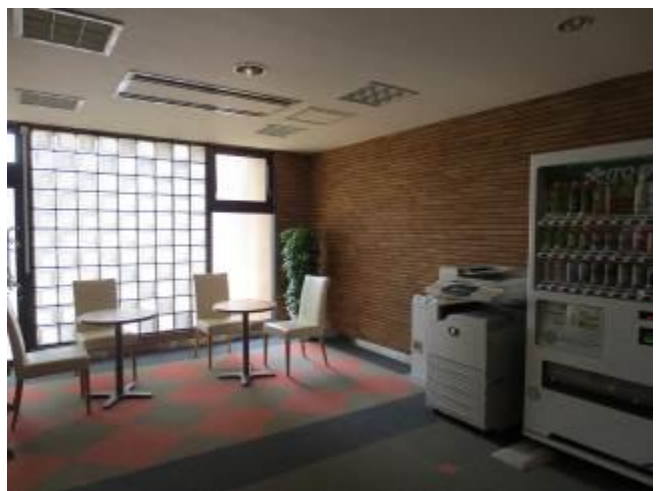
< ラウンジ Lounge >