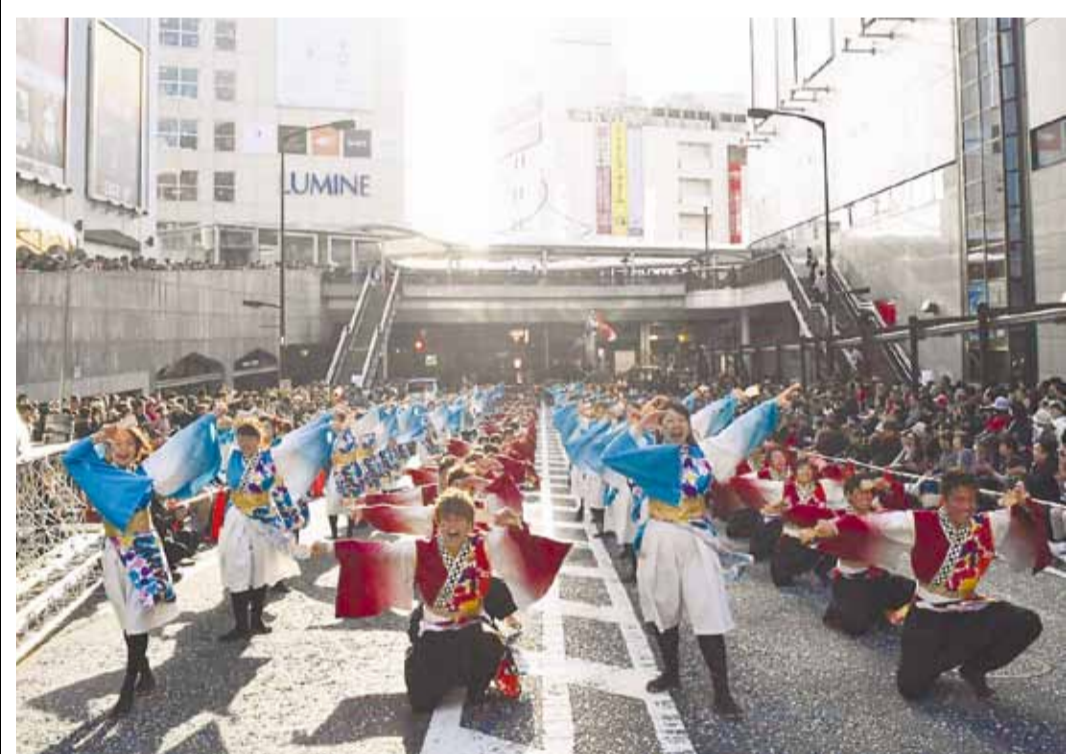
Hosei's Hoyoren club performs Yosakoi Soran at an event in Machida, Tokyo.