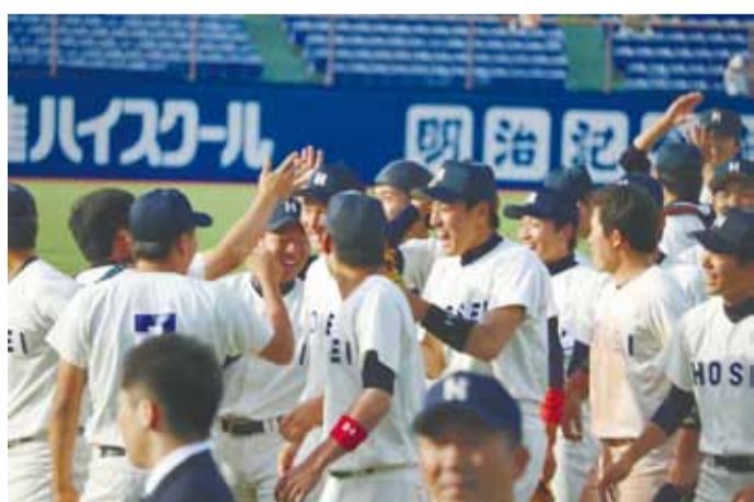
Hosei University's baseball club celebrates a win at Meiji Jingu Stadium.