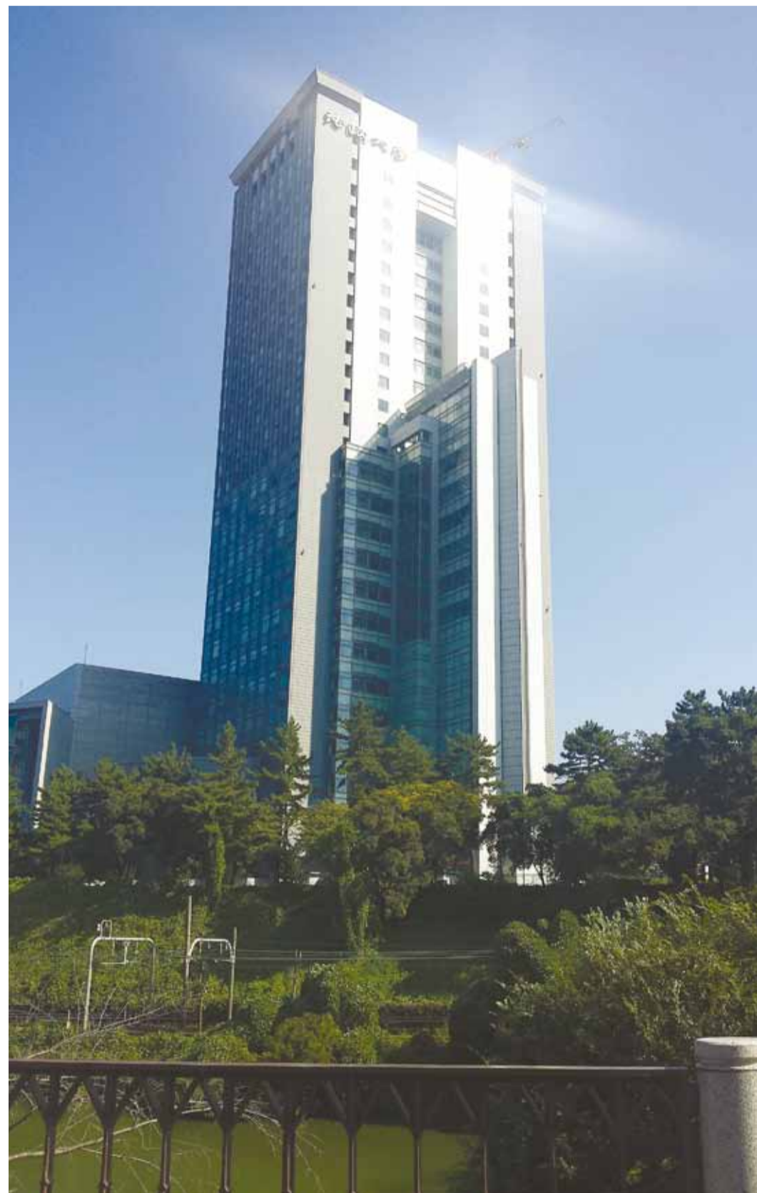
Built in 2000, the 27-story Boissonade Tower, a symbol of Hosei University's Ichigaya Campus in Tokyo, stands out against the blue sky.