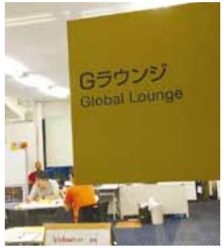
G-Lounge in Ichigaya Campus is located on the first floor of the 55th Building.

"What you learn in the G-Lounge is not something