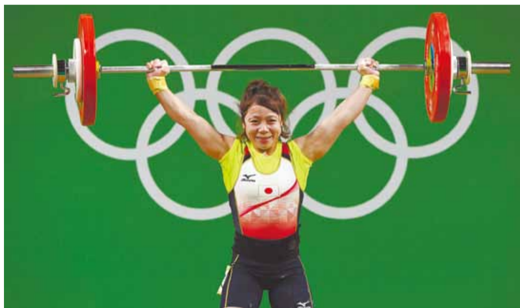
Above: Hiromi Miyake hoists 107 kg in the clean and jerk on her third attempt in the women's 48-kg weightlifting competition on Aug. 6 in Rio de Janeiro. Right: Hiromi Miyake speaks to the Hosei Herald in an interview in Tokyo on Nov. 26.